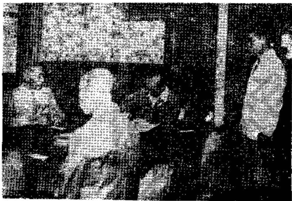
1945年10月6日 台湾日军第十方面军参谋长谏山春树在 台湾总督府签收第一号受降备忘录