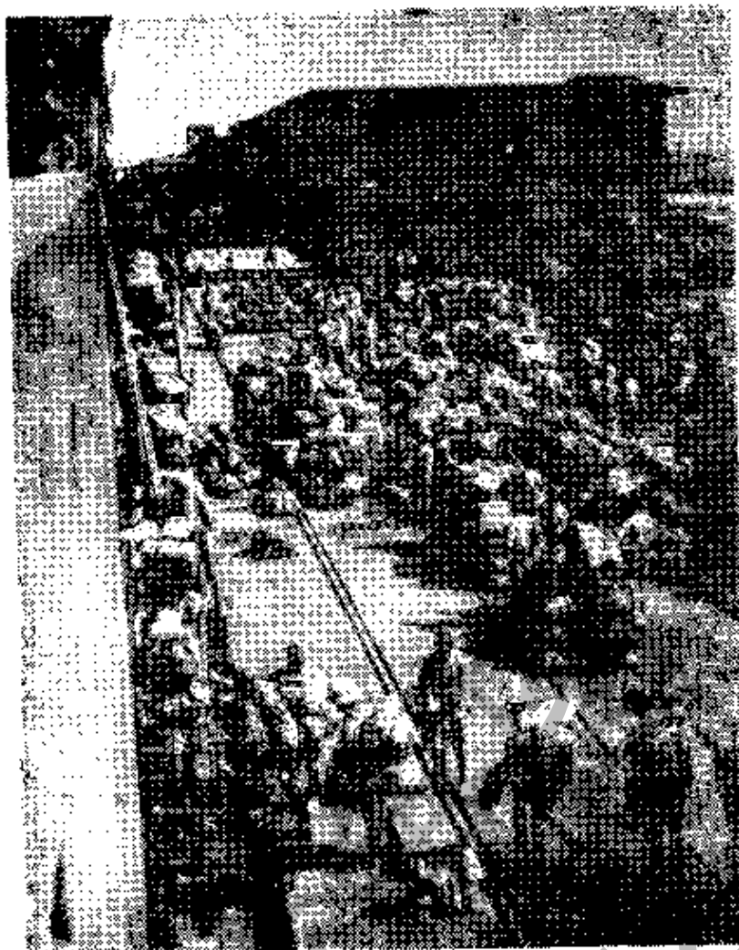
高雄日军集中 营之战俘被遣 返回国