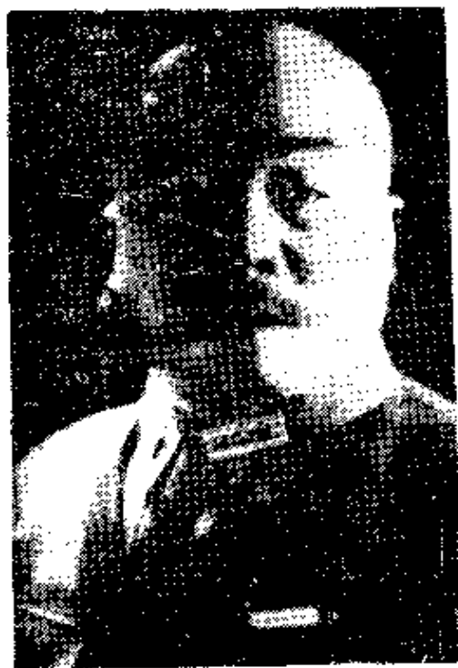
1945年—1947年 台湾省行政长官公署行政长官 陈 仪