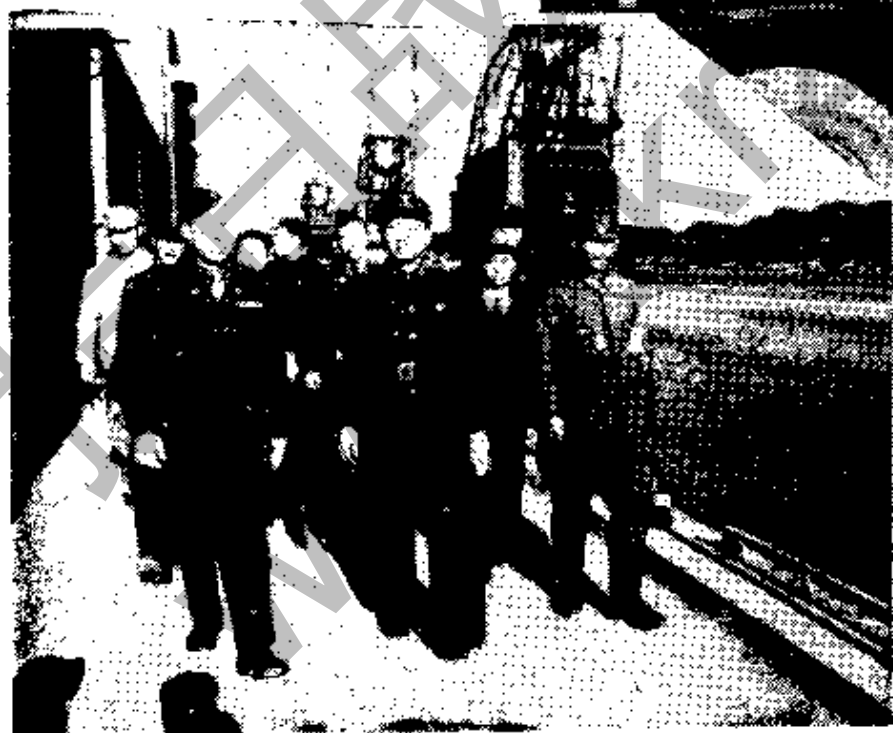
美军联络组 视察遣返日 军工作